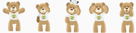
happy sad confused worried surprised