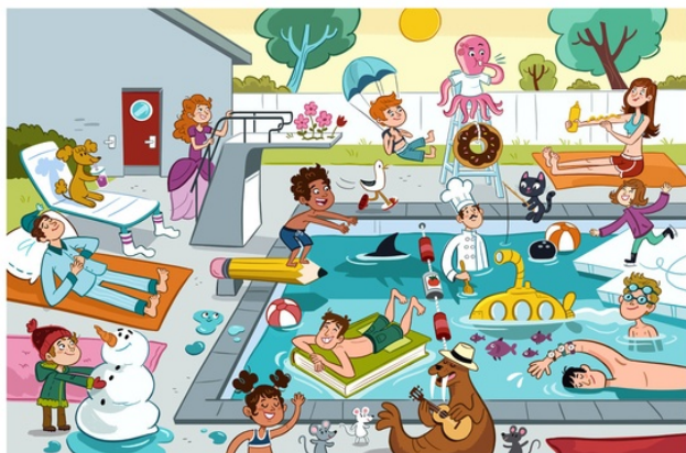
Silly Swim Client: Highlights Puzzlemania

Example: Loudly the walrus played the guitar beside the noisy swimming pool full of people.